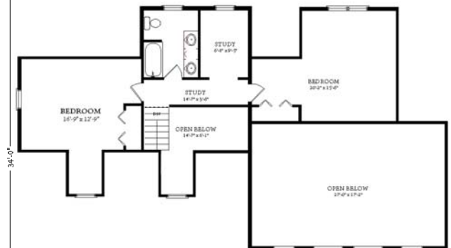
Proposed 2nd Floor (To be Finished Onsite)